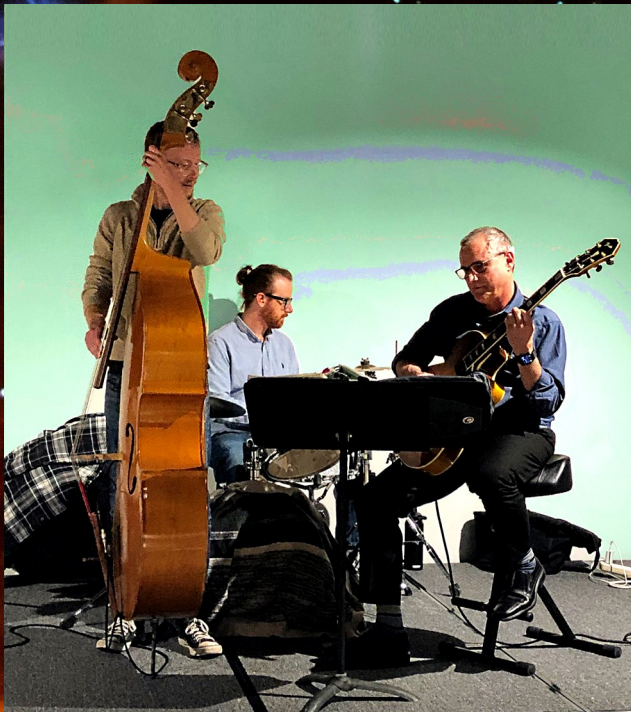
Holiday tunes with a smooth jazz groove