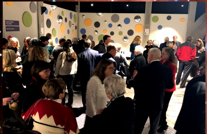
A full house of festive Pioneers