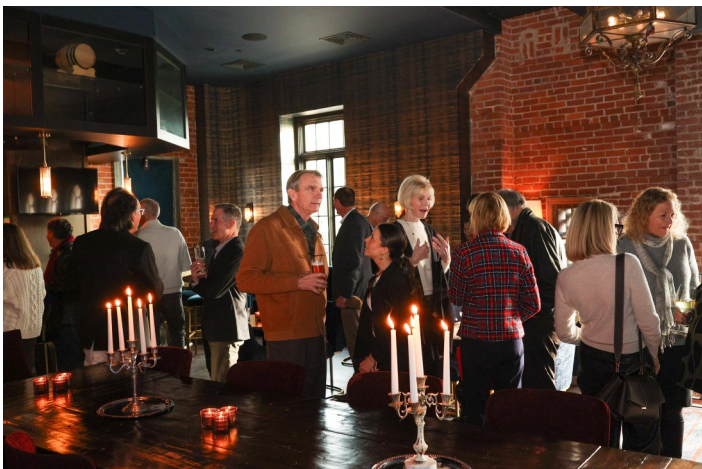
Pioneers gather at the Star Lounge to celebrate the discovery of gold anniversary