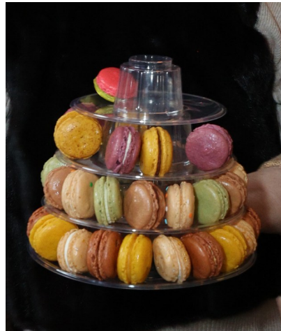
Specialty of the House at Le Macaron