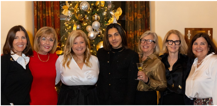
Holiday Revelers at the Sutter Club