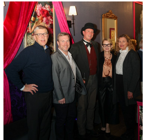
Commemorating the 1869 dedication of Pioneer Hall